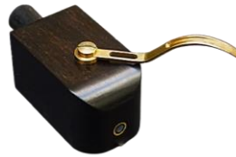
Type Designation: DT101k