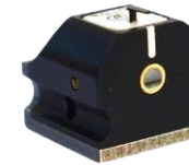
Type Designation: DT101uq