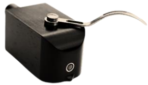
Type Designation: DT101kq

Body: Tonewood, Brass, Bone, nacre Type: MC. Mono dose. approx. 31mm from diamond tip to front of bayonet Mt. Vertical shaft without iron. Pretensioned axial mono generator. NdFeB. Pure silver - wiring & -contact. Weight: approx.24±0.5g / Impedance: approx. 12 Ω Output Voltage: 0.4 mV ± 2dB Hz/5.6cm/Sec Frequency Range: 20Hz to 20kHz Tracking Force: 2.5-3.5 (Recommended 2.8 g) Compliance: 8 x 10 -6 cm/dyne at 10 Hz