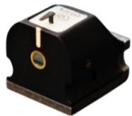
Type Designation: DT101u