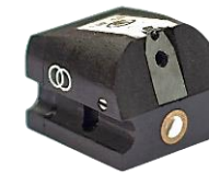
Type Designation: DST201uf

Body: Tonewood, Brass, Bone, nacre Type: MC. Stereo 1/2 inch system. Nonferromagnetic core generator. Boron cantilever. SmCo. Pure Silver wiring. Double-hardened pure silver contact pins. Weight: approx.22±0.5g / Impedance: approx. 16 Ω Output Voltage: 0.2 mV ± 2dB 1kHz/5.6 cm/Sec/L&R 45° Frequency Range: 20Hz to 35kHz Tracking Force: 1,7-1,9g (Recommended 1.8g) Channel Sep.: a>27db / 1kHz Compliance: 12 x 10 -6 cm/dyne at 10 Hz