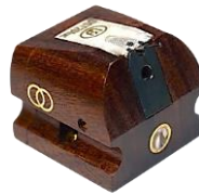
Type Designation: DST201ua

Body: Tonewood, Brass, Bone, nacre Type: MC. Stereo 1/2 inch system. Nonferromagnetic core generator. Boron cantilever. SmCo. Pure copper wiring. Double-hardened pure silver contact pins. Weight: approx.11±0.5g / Impedance: approx. 16 Ω Output Voltage: 0.2 mV ± 2dB 1kHz/5.6 cm/Sec/L&R 45° Frequency Range: 20Hz to 35kHz Tracking Force: 1,7-1,9g (Recommended 1.8g) Channel Sep.: a>27db / 1kHz Compliance: 12 x 10 -6 cm/dyne at 10 Hz