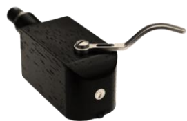
Type Designation: DT101lq

Body: Tonewood, Brass, Bone, nacre Type: MC. Mono dose. approx. 51mm from diamond tip to front of bayonet Mt. Vertical shaft without iron. Pretensioned axial mono generator. NdFeB. Pure silver - wiring & -contact. Weight: approx.25±0.5g / Impedance: approx. 12 Ω Output Voltage: 0.4 mV ± 2dB 1kHz/5.6 cm/Sec Frequency Range: 20Hz to 20kHz Tracking Force: 2.5-3.5 (Recommended 2.8 g) Compliance: 8 x 10 -6 cm/dyne at 10 Hz