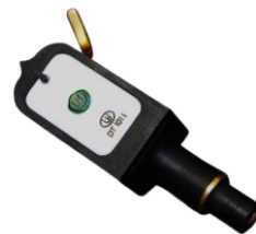
Type Designation: DT101l